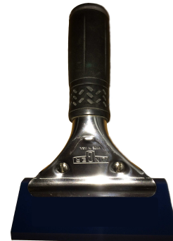
Standard Squeegee (for 3M™ FASARA™)